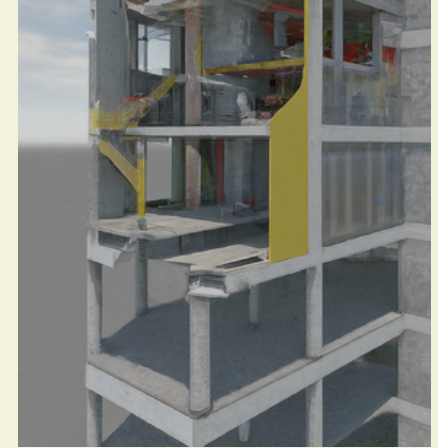
Detailed Building Section