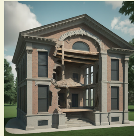
Historical Building Renovation