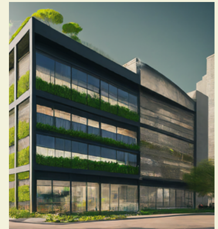
Sustainable Design Analysis

We depict innovative architectural forms, sustainable infrastructure, and seamless integration with nature through BIM.